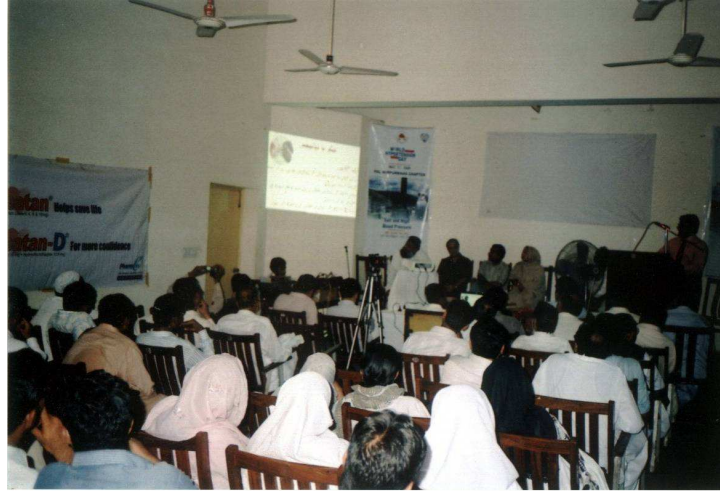
Public awareness lecture at Civil Hospital Mirpurkhas.