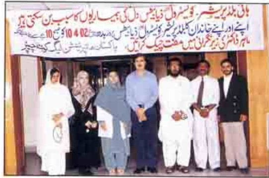
Doctors participants of PTV Quetta Camp, 10th April, 2002