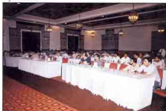
View of the Audience of the Faisalabad Chapter Inauguration.