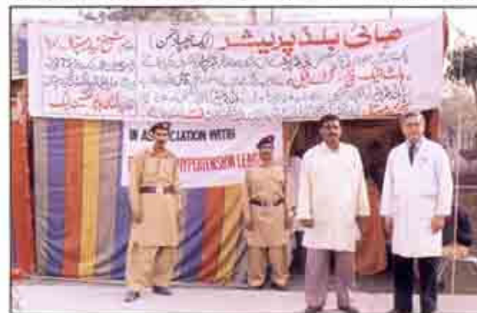
Public awareness camp by Lahore Chapter of PHL.

Public awareness day was organized by the Sheikh Zayed Hospital in Collaborative with PHL local chapter on 27-04-2002 under the supervision of Dr. Saulat Siddiqui, 350 people were examined who also