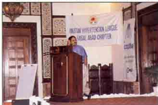
Inauguration of Faisalabad Chapter of PHL.

The launching of Faisalabad Chapter of PHL was performed on 20th October, 2001, in Hotel Serena which was attended by over 100 Physicians and